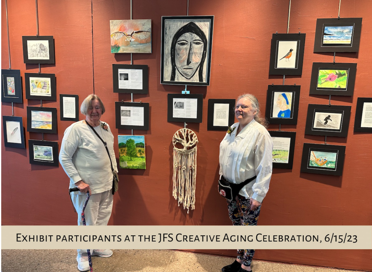
EXHIBIT PARTICIPANTS AT THE JFS CREATIVE AGING CELEBRATION, 6/15/23